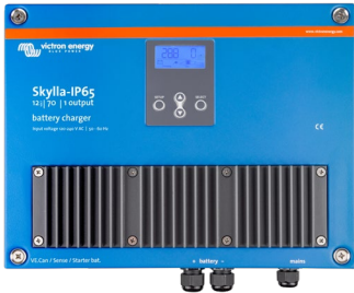
Skylla-IP65 12/70 (1+1)